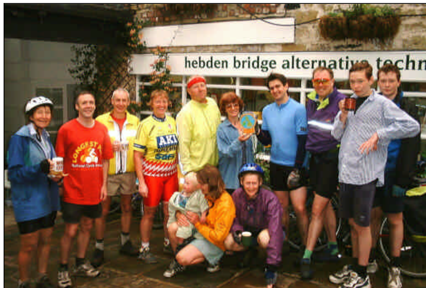
Cyclists at the launch of the Hebden Bridge section of the new National Cycle Network. The 5000 mile cycle route now pass through most major towns and cities in the UK.