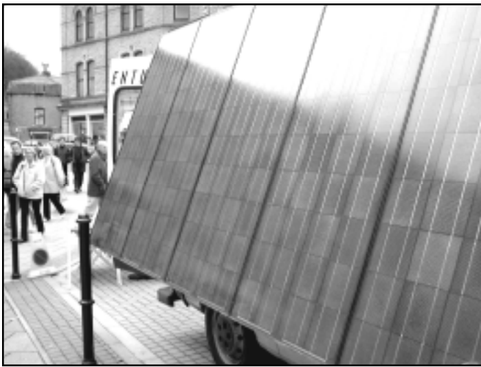
Solar power panels being demonstrated in St George's Square during the Big Green Weekend